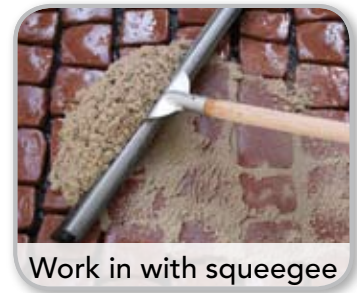
Work in with squeegee